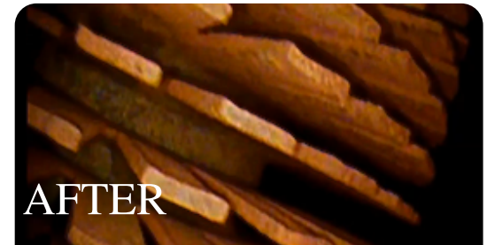
Finned tubes after EPIC cleaning