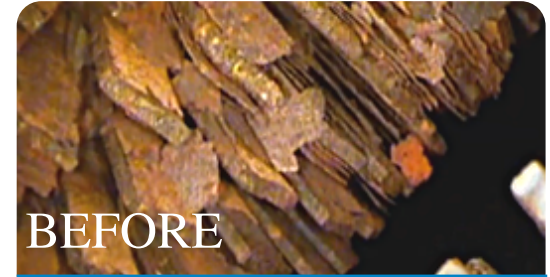
Impacted deposits on finned tubes