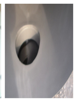
After sponge blasting - achieved the maximum degree of cleaning