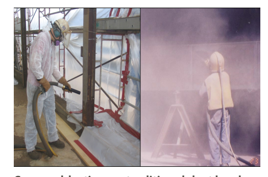
Sponge blasting vs. traditional dust levels

Any of 20+ different micro-abrasive types and grit sizes can be imbedded in the media. The abrasives range from 0-150 micron to achieve 0-6+mil profile options. It safely removes deposits from ultra-soft surfaces without damage to the substrate, or profiles for superior coating adhesion. Unique synthetic foam and engineered abrasives provides an optimum angular profile.